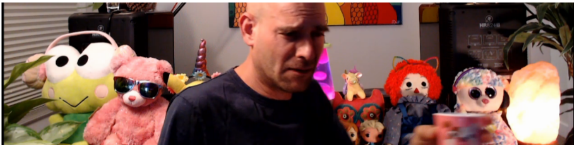
Figure 2: Dave Dresden, on Neptune, experiencing a pang of sadness.